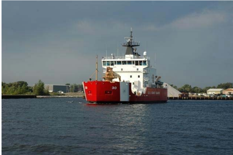
Fig.10. Underway during builder's sea trials September 9 th , 2005.

The U.S. Coast Guard and the Great Lakes maritime are looking forward to the delivery of the new MACKINAW around November 1 st . Figure 10 shows the new cutter underway on September 9 th during builder's sea trials. Following further outfitting and some minor modifications such as the addition of AIS, the cutter will commence ready-for-sea certification, operational testing and evaluation, and ice trials. The old icebreaker MACKINAW and buoy tender ACACIA are funded to operate through next June, so the new cutter will have no operational tasking until commissioning in June of 2006. The new multi-mission, DP-capable cutter should be worthy of the legendary name MACKINAW and will serve the Great Lakes for many, many years.