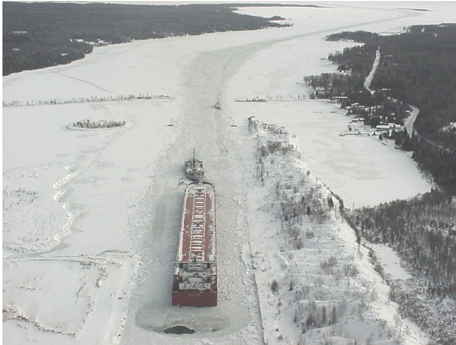
Fig. 8, USCGC MACKINAW assists a 1000-foot iron ore ship beset in the 300' wide Rock Cut of the St. Mary's River

the St. Mary's River. Brash ice is the accumulation of ice made up of fragments not more than six feet across. The ore carrier, 1,000 feet long with a beam of 105 feet, spent nearly a week stuck in this narrow cut which is blasted from bedrock. The old MACKIAW doesn't have the maneuverability and ship control required to circumnavigate the beset freighter in this 300-foot wide channel, and can only work at flushing the area directly in front of it. The smaller WTGB could maneuver alongside the freighter in the cut in open water, but doesn't have the power to deal with the deep brash ice.