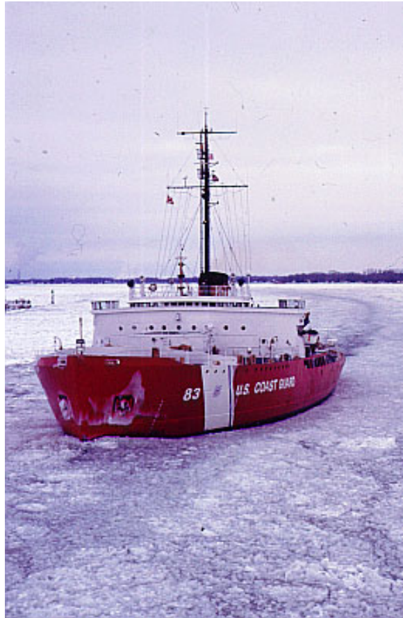
Fig. 1. USCGC MACKINAW (WAGB 83)

MACKINAW is currently the only heavy icebreaking resource assigned to the Great Lakes, and it is capable of breaking level ice of 32 inches (0.8 meters) thickness at a speed of 3 knots. Although it was the world's largest and most powerful icebreaker when commissioned, it has become increasingly costly to support. A 1998 analysis of alternatives found that construction of a multi-mission heavy icebreaker was the best solution for a replacement. The old MACKINAW is scheduled for decommissioning in June of 2006. The venerable cutter is shown in Figure 1.