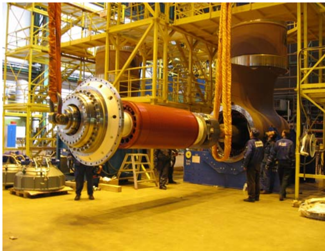
Fig. 5. Assembly of one of the 3.36MW azimuthing podded propulsors.

The new MACKINAW's design is based on the use of twin azimuthing podded propulsion units, the first of its kind aboard a USCG vessel. Each unit contains an electric motor driving a 10-foot fixed-pitch propeller, and the propulsion units can be slewed through 360 degrees providing outstanding maneuverability. One of the units is seen during assembly in Figure 5. The design eliminates the need for conventional shaft lines, rudders, and steering gear. Electrical power for propulsion, bow thruster, and ship service loads is provided by a state-of-the-market AC/AC integrated diesel-electric power plant utilizing three medium-speed diesel engines / generator sets that produce 3130 kW each. A separate auxiliary diesel generator will provide 718kW when at anchor or away from shore ties.