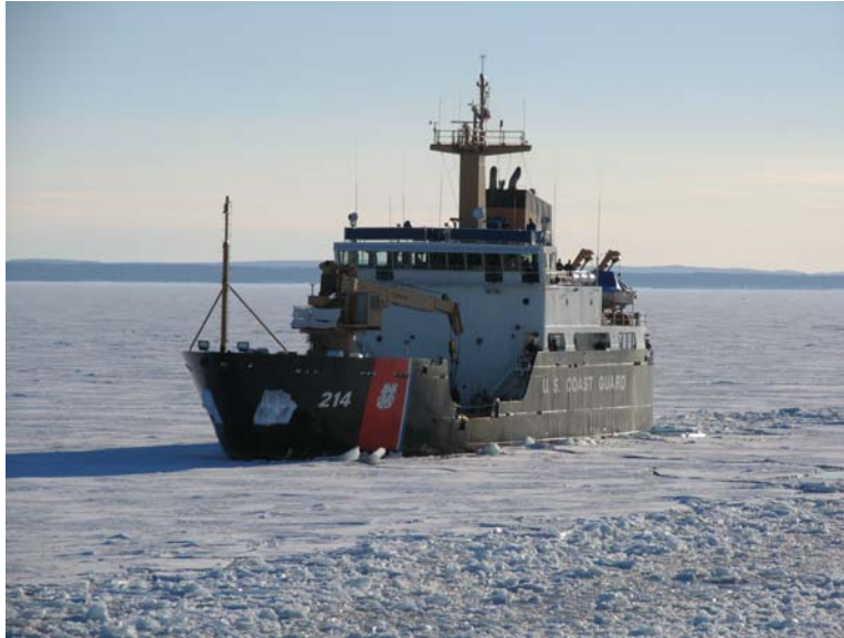
Fig. 2. USCGC HOLLYHOCK (WLB 214) on Lake Michigan.

The new 225-foot buoy tenders, while far more capable than the WWII-era 180s, are designed to break only 14 inch solid level ice going ahead, and their icebreaking capability astern is severely limited. One of the 225s is shown in Figure 2.