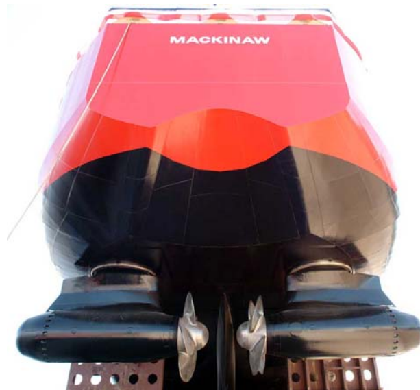
Fig. 7. MACKINAW's stern just prior to launch. Pods are slewed inboard to protect them during the side launch.

During builder's sea trials conducted on Green Bay in early September the new MACKINAW achieved 16.1 knots into a 2- to 4-foot chop. This confirms the validity of the PSDA speed projection and indicates that the icebreaking projections should be valid as well. Figure 7 shows the azimuthing podded propulsors just prior to launch on April 2 nd , 2005.