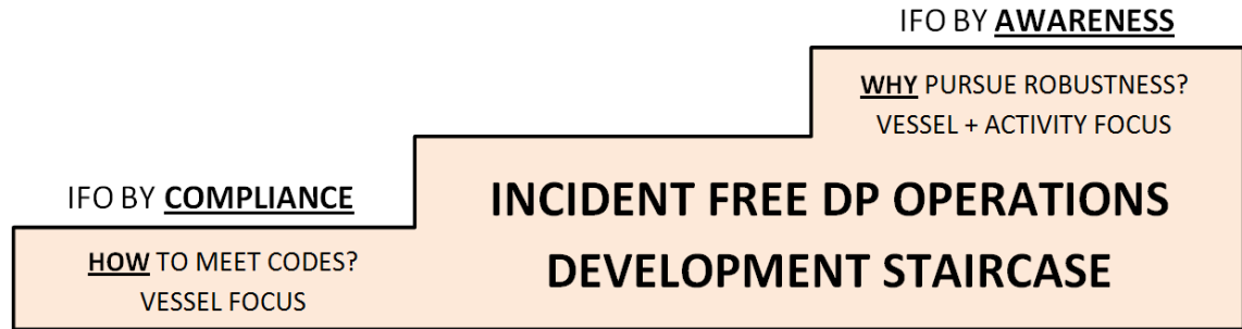
Figure 1-1 Development Staircase

1.2.5 The graphic below is used to visualize the above point.